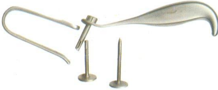
E1.180 Trocar Set