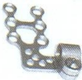
FP- LF1– L/R Titanium Fixation plate, Lefort 1 Type, 6 holes